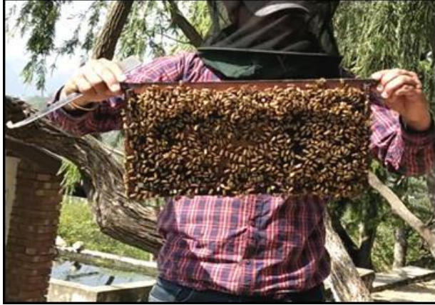
Figure.1 Visual observation of hive