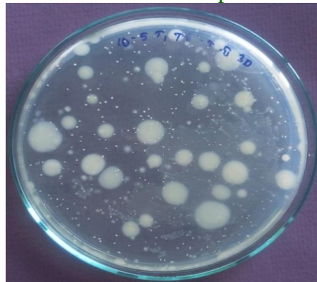
Fig.1 Petri dishes showing Total Viable Count of turmeric powder added water treated chicken breast meat samples

Note: DW-Distilled water, TW-Tap water, T1-10% Turmeric Powder added water, T2-16.67% Turmeric Powder added water, T3-23.33% Turmeric Powder added water, T4-30% Turmeric Powder added water.