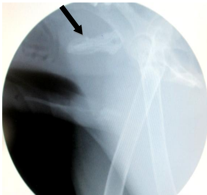
Fig.1 Survey radiograph of radio-opaque curled foreign body (black arrow) in the bladder

mg/kg BW, I/V and maintained by using Isoflurane. The animal was placed in dorsal recumbency and the skin incision was given left paramedian to the penis and abdomen opened over linea alba. Semi distended urinary bladder was exteriorized and given a stab incision over its dorsal border to remove red coloured urine. The foreign body (Fig. 2) was retrieved out with the help of Allis tissue forceps. Few small calculi were also removed. Once again the calculi in urethra were flushed with normal saline into bladder and removed. Cystorrhaphy was done in double inversion manner using polyglactin 910 no. 3/0, linea alba using polyglactin 910 no. 1 in simple interrupted manner and skin in horizontal mattress pattern using polyamide black no. 1. Post-operatively it was administered with 300 ml RL, inj. Ceftriaxone @ 20 mg/kg BW and meloxicam @ 0.2 mg/kg BW I/V for next 5 days along with alternative days dressing. The foreign body retrieved was found to be a recoiled electrical insulated wire covered with multiple sharp irregular small calculi (Fig. 3a) and it was measured > 30 cm in length in its fully extended state (Fig. 3b).