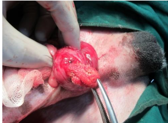
Fig.3 Retrieved foreign body, an insulated electric wire covered with rough edged calculi (3a) and extended electric wire measured about > 30 cm in length (3b)