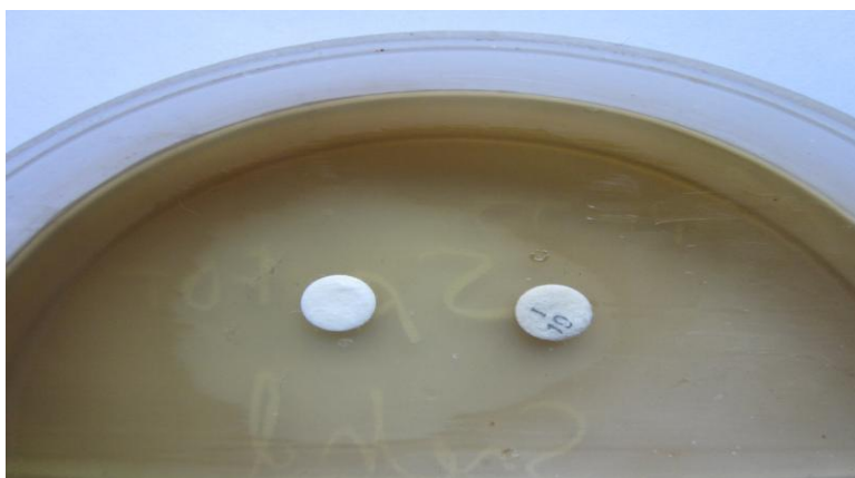
Fig.1 Imipenem-EDTA DDST

Out of 100 P. aeruginosa 15 isolates were resistant to imipenem