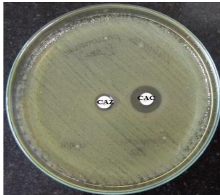
CAZ – Ceftazidime; CAC- Ceftazidime with clavulanic acid. Zone enhancement of > 5mm with CAC