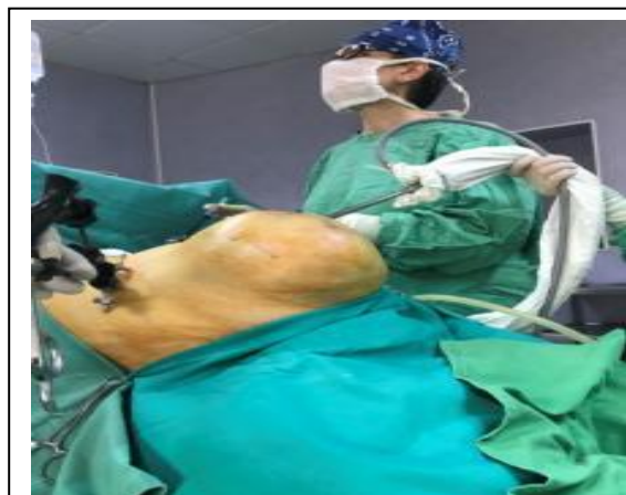
Figure.5 Laparoscopic cholecystectomy in a patient with giant umbilical hernia