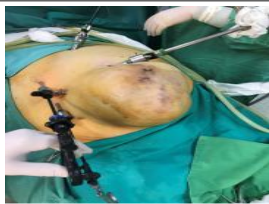
Figure.2 Trocars position in laparoscopic cholecystectomy in a patient with irreducible umbilical hernia