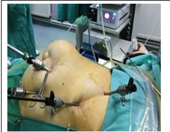
Figure.1 Trocars position in the laparoscopic resection of a gastric polyp through the incisional hernia sac.