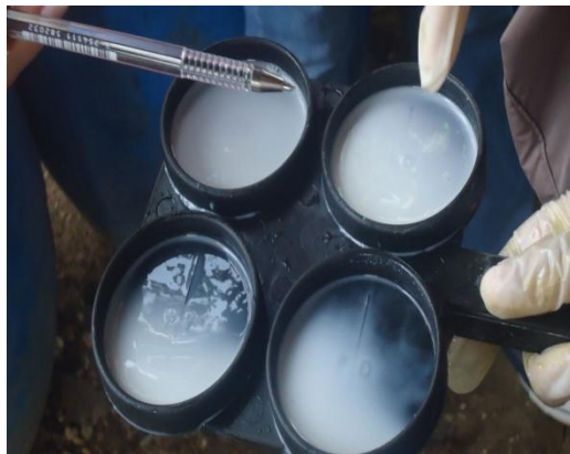
Fig.1&2 CMT using strip cup & Plate showing colonies at 10 -4 dilution