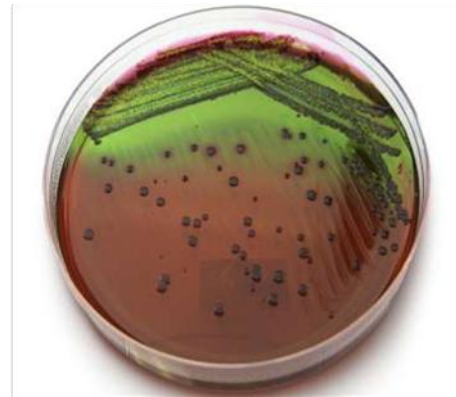
E. coli on EMB agar