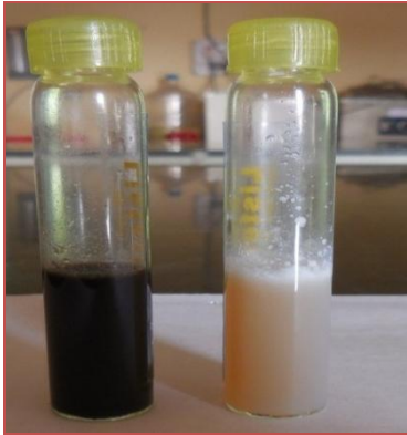
Detection of Listeria