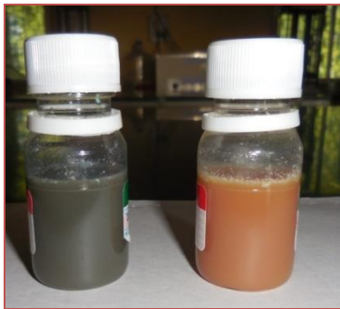
Detection of E. coli