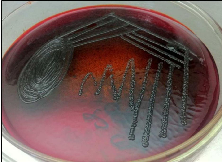
Fig.2 Red/orange coloured colonies non biofilm producer