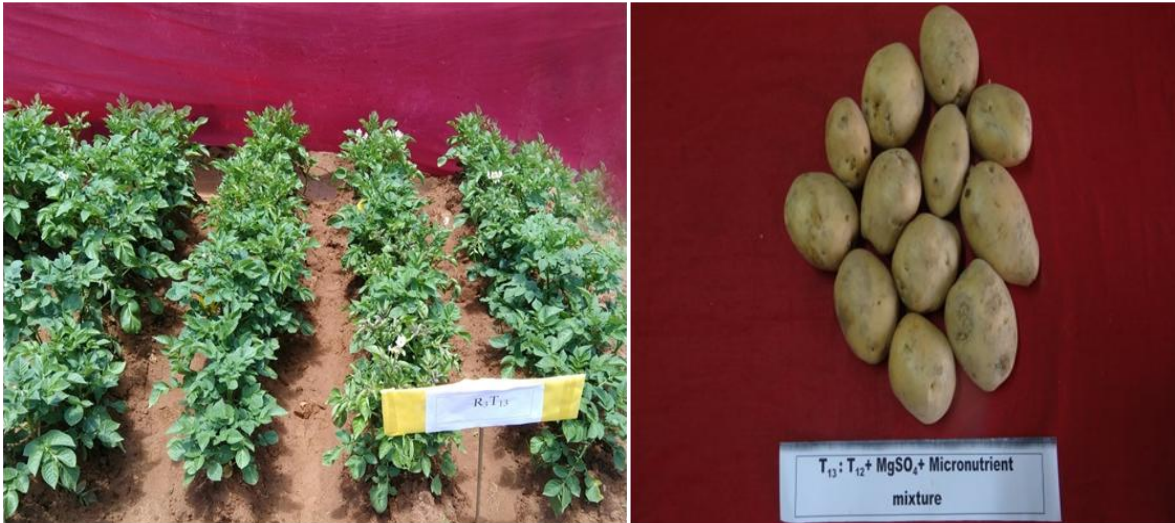
T 13 – 75 % RDF + Azotobacter + PSB + KSB + MgSO 4 + Micronutrient mixture