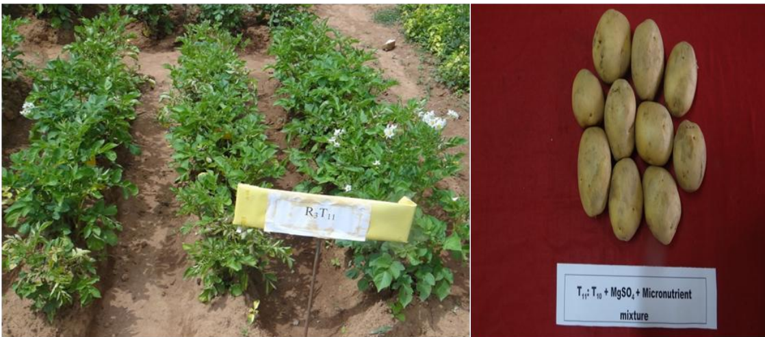
T 11 – 50 % RDF + VC + Azotobacter + PSB + KSB + MgSO 4 + Micronutrient mixture

The tuber length and tuber circumference varied significantly as influenced by different integrated nutrient management (Table 2) practices. Plants which were fertilized with Azotobacter + PSB + KSB + MgSO 4 + Micro nutrient mixture + 75 % RDF (T 13 ) recorded the maximum tuber length (8.79 cm) and tuber circumference (15 cm). Increased tuber length and circumference in these treatments could be related to increased plant height, number of stems/plant and number of leaves/plant which were positively contributed towards tuber