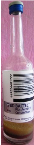
Fig.1 BACTEC Aerobic Culture Bottle