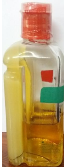
Fig.3 Biphasic Blood Culture Bottle