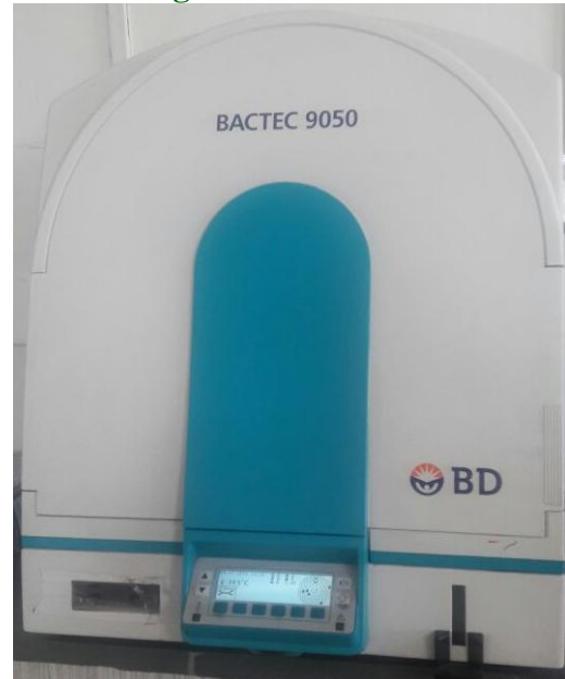
Fig.2 BACTEC 9050