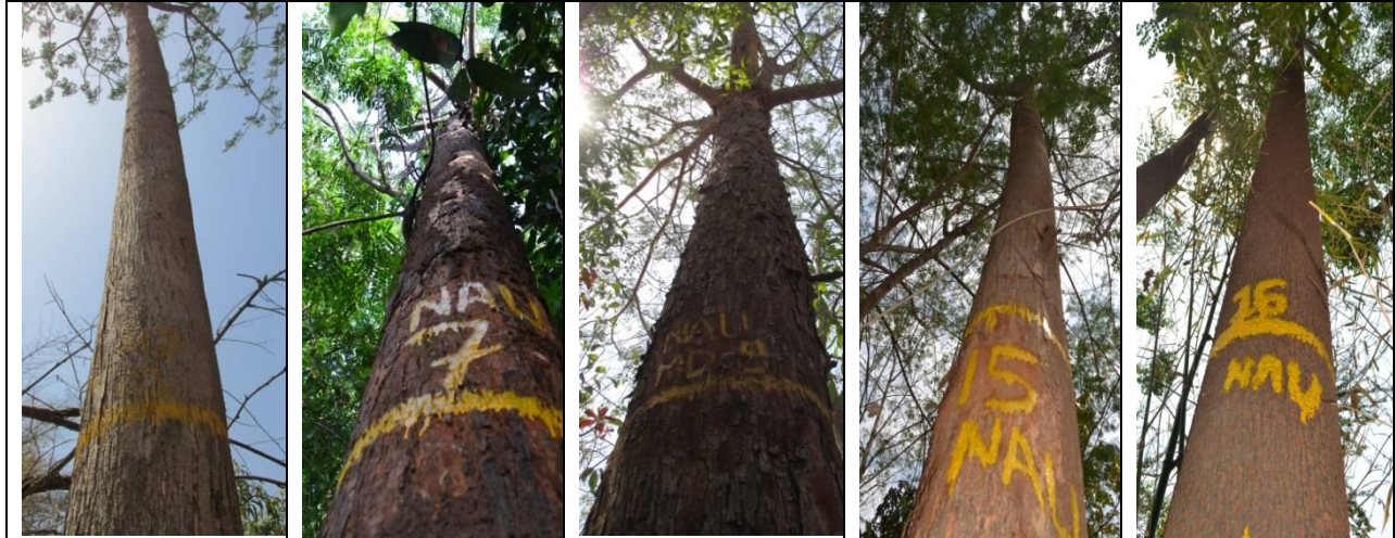
Fig.1 Selection of Candidate Plus Trees (CPTs) and collection of M. dubia Cav. in South Gujarat