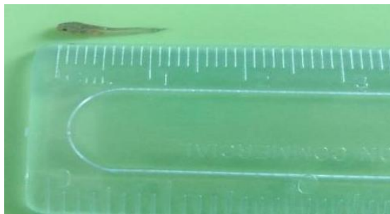
Fig.3 Twenty day old fry of Mystus cavasius

Fry at 20 day stage exhibits facultative air-breathing behaviour, reduced cannibalism and general adult-like behaviour. The fry can be stocked for grow out at this stage