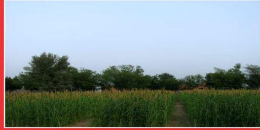
Plate : 1 A view of field experiment of pearl millet