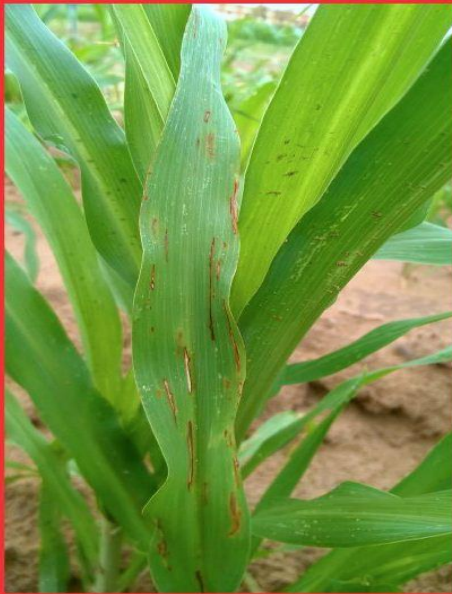
Leaf spot infected plants