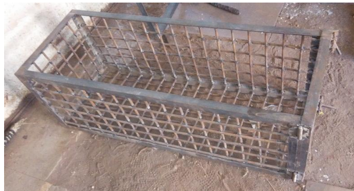
Fig.4 a. Detailed drawing of stone collector; b. Developed stone collector