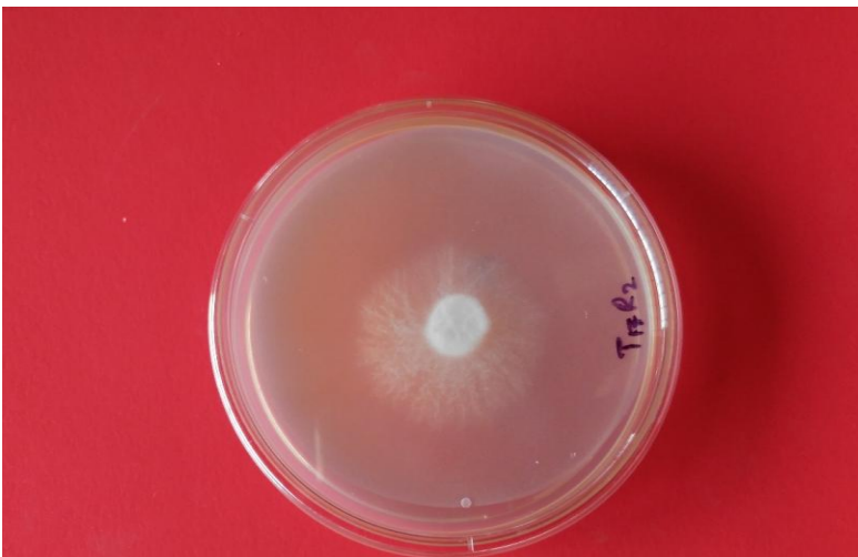
Fig. 2 Growth of Shiitake mycelia on PDA