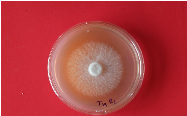
Fig. 1 Growth of Shiitake mycelia on sorghum meal agar media