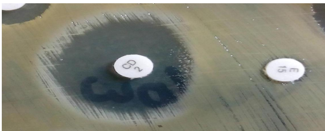
Fig.1 Isolate with inducible clindamycin resistance or positive D-zone test with blunting (D-shaped) of clindamycin zone of inhibition proximal to the erythromycin disk