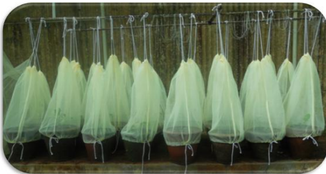
Plate 1 Radish plants raised singly in a pot and covered with nylon mesh under greenhouse condition