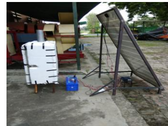
Modified Solar Dryer