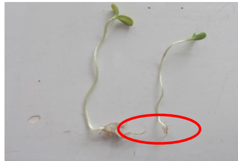
0.5 % and 0.6 % Nano Boron