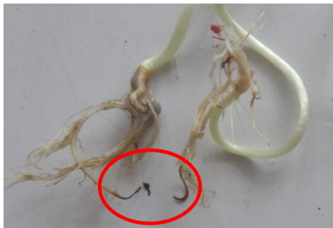
0.5 % Nano Boron and Borax