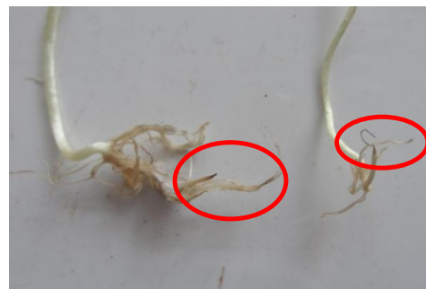
0.5 % and 0.6 % Nano Boron