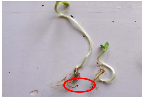
0.5 % Nano Boron and Borax