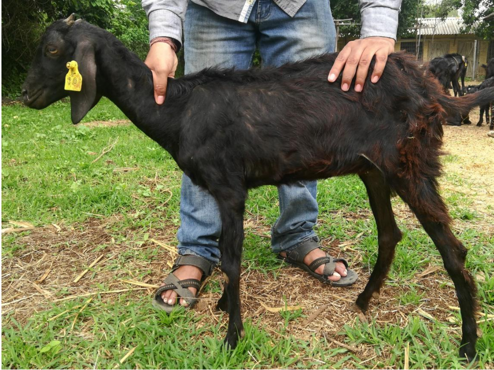
Fig.4 Improved body condition on 30 th day of trial