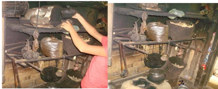
e. Drying and storing food items near the fireplace of traditional kitchen