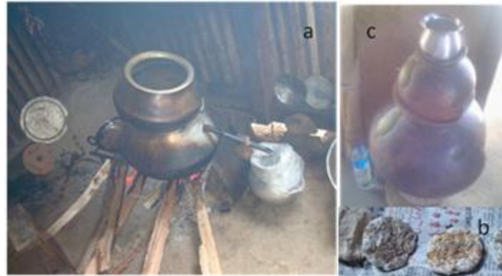
Fig.2 Plant based traditional process food