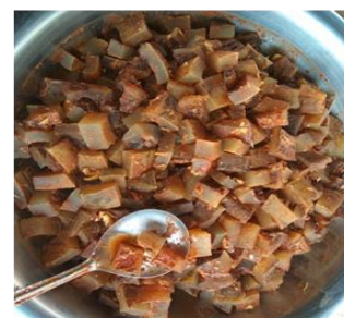
c. Guaihgi kang Tam