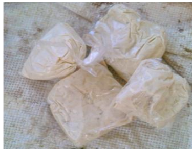
b. Zanhtha lummei (Beef)