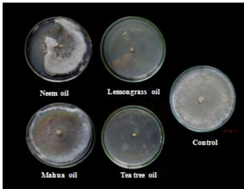
Plate.4 Evaluation of bio-fumigant nature of oil cakes against R. solani under in vitro conditions