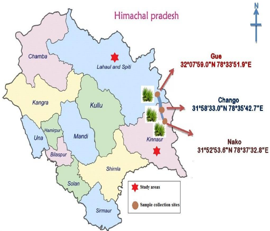
Fig.1 Location map showing study areas along with sample collection sites