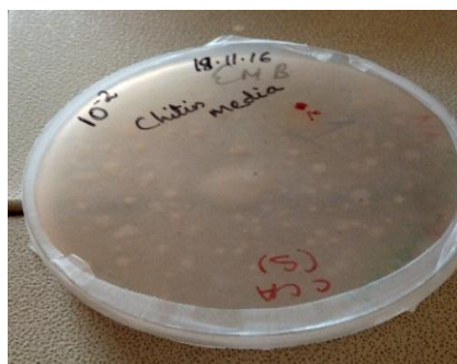
Fig.1 Chitinolytic bacterial isolates on chitin agar medium by spread plate method at Different dilution