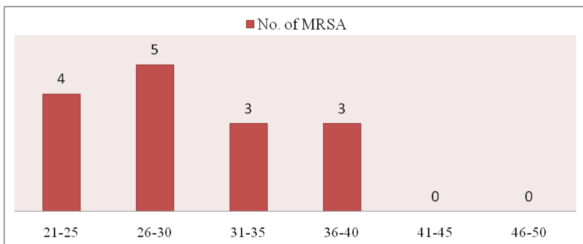
Fig.1 Age wise distribution of MRSA positive isolates