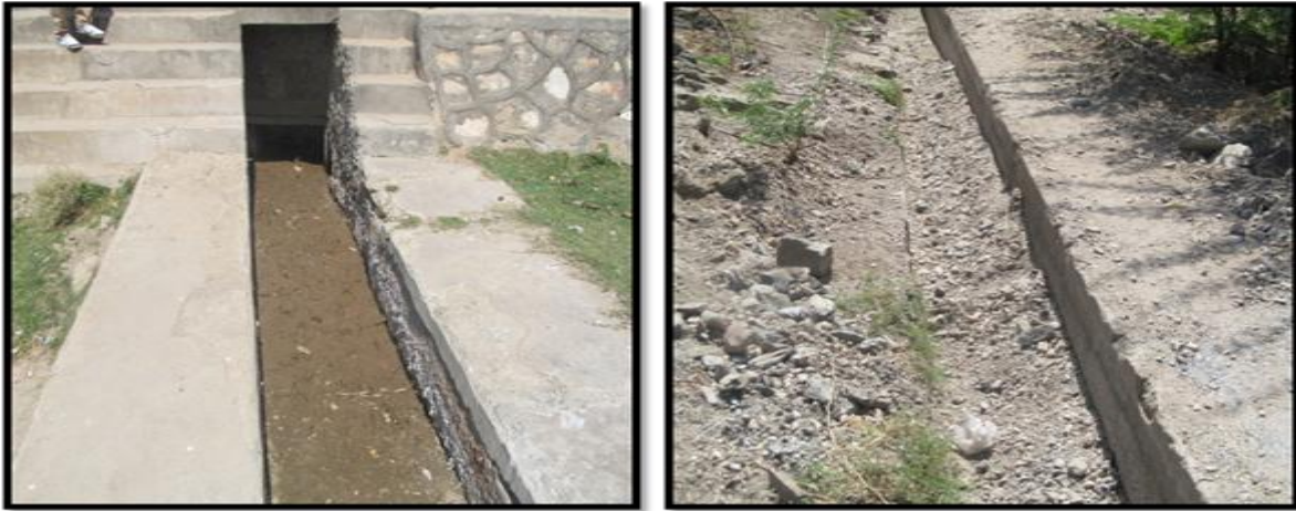
Fig.3 Damaged Jhadol Minor at starting and middle of minor