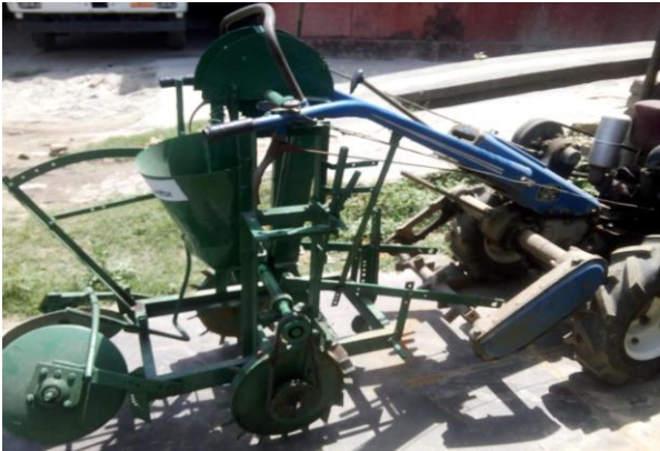
Fig.1 Planter attached with power tiller