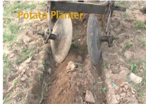
Fig.2 Covering of seeds with bund former