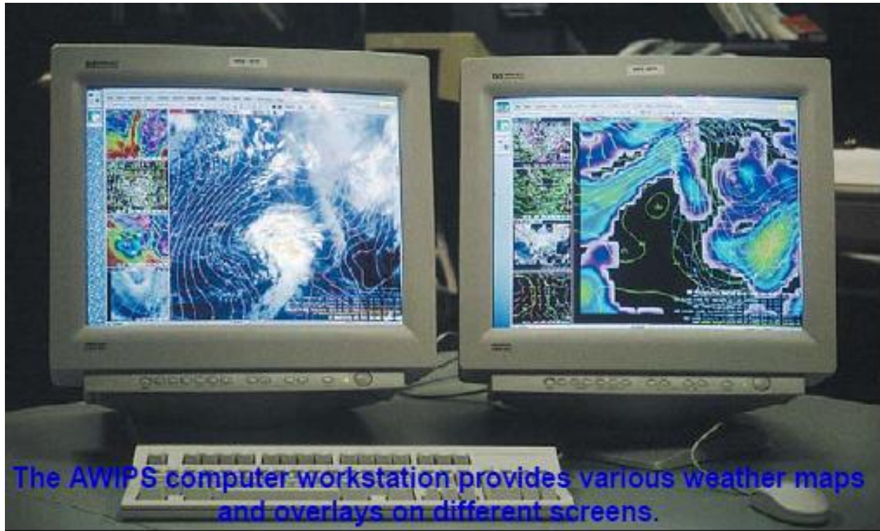
Fig.2 Disseminating weather information through different agencies