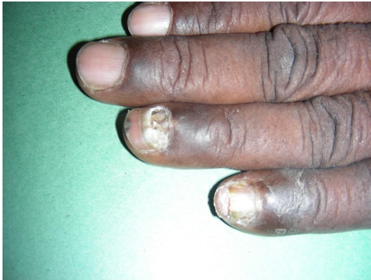
Fig.3 Total dystrophic onychomycosis of middle finger