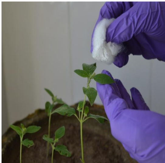
Plate.11 Plants just before sap inoculation