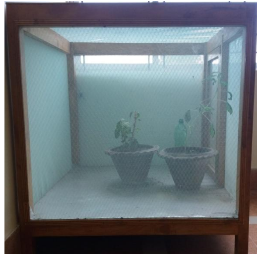
Plate.4 Acquisition feeding of leafhopper