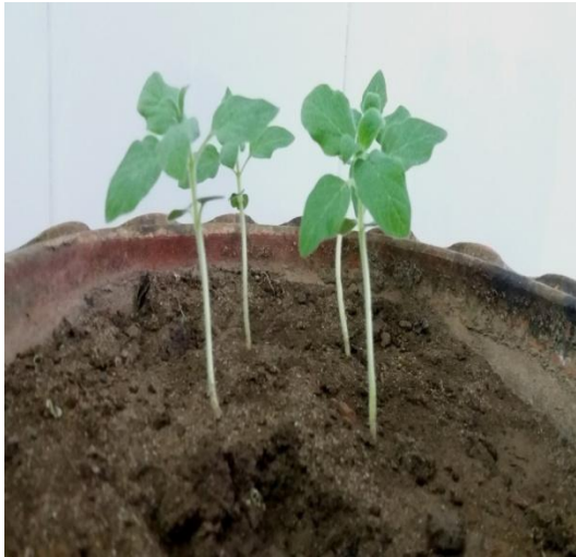
Plate.3 Raising of Sesamum plants