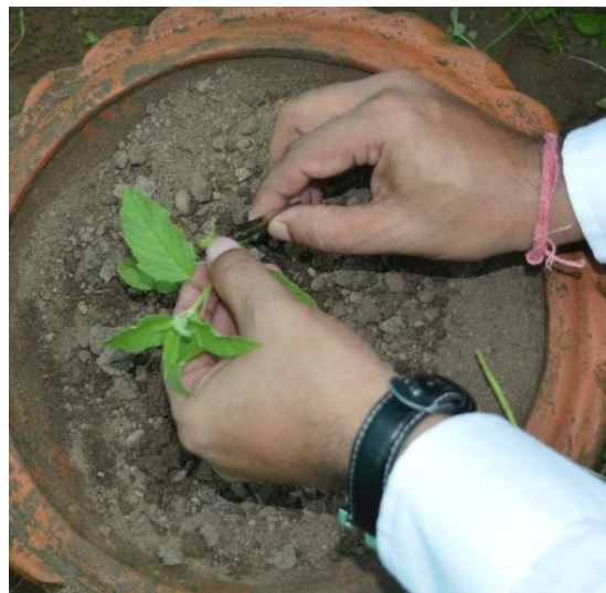
Plate.6 Slice cut for grafting