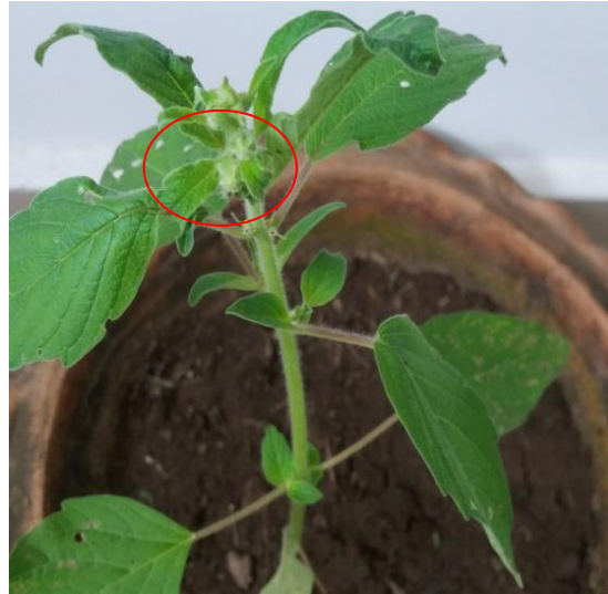
Plate.14 Symptom in graft transmitted plant