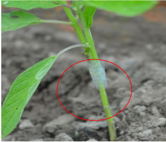
Plate.7 Para film wrapping