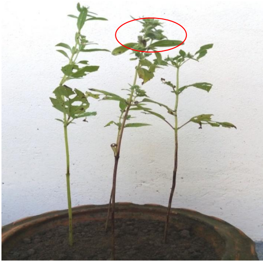
Plate.13 Symptom in insect transmitted Plants