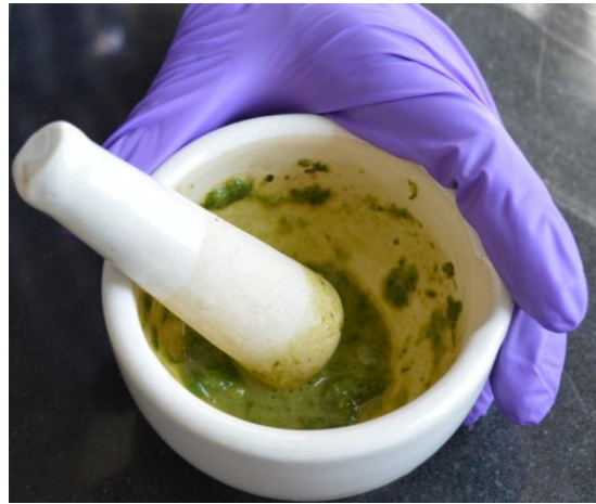
Plate.10 Grinding of diseased plant tissue