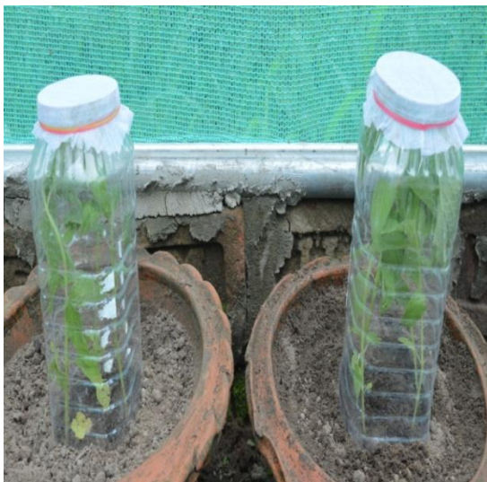
Plate.5 Inoculation feeding of Leafhopper