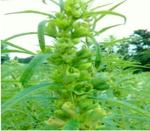
Plate.1 Floral virescence