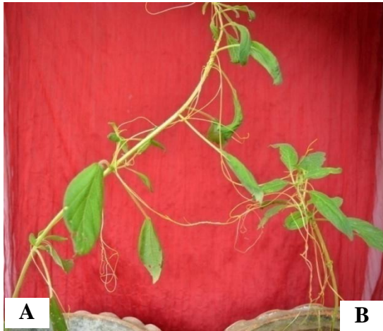
Plate.9 Dodder transmission (A) Infected plant (B) Healthy plant