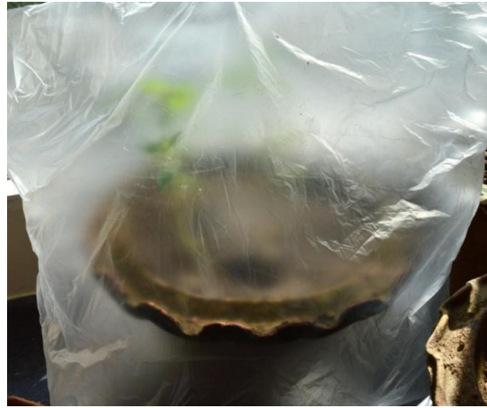
Plate.8 Grafted plant inside humid chamber