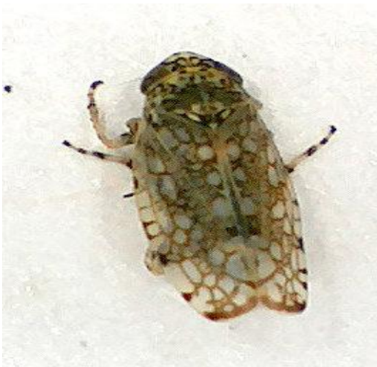
Plate.12 Orosius albicinctus Dist.