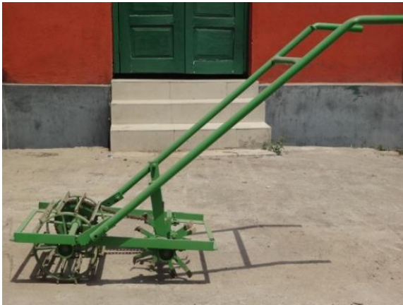
Fig.1 Side view of rotary weeder