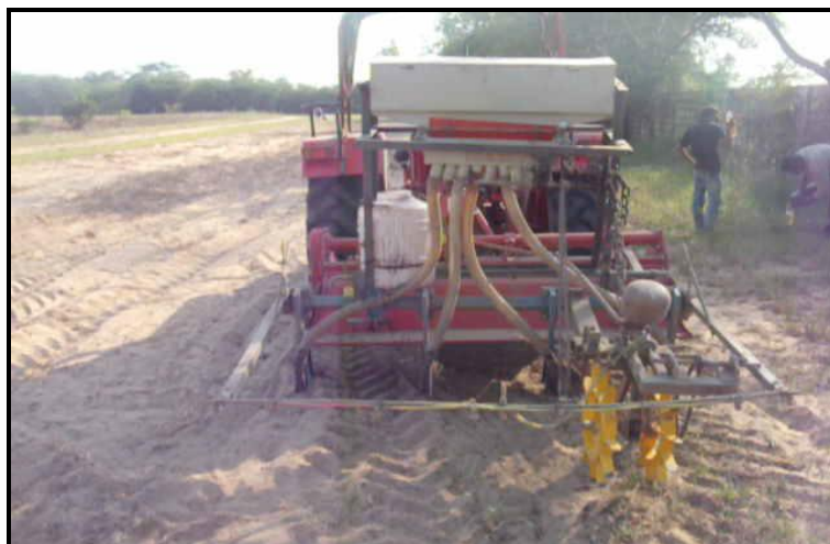
Fig.7 Time taken by individual operations and in roto drill cum herbicide applicator