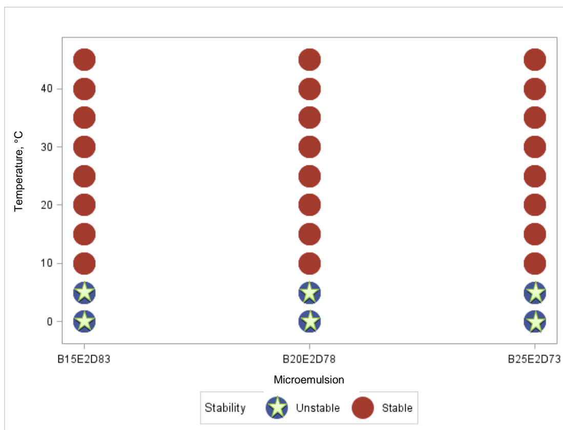
Fig.1 Stability of microemulsions of 200°, 195° and 190°proof ethanol at different temperatures