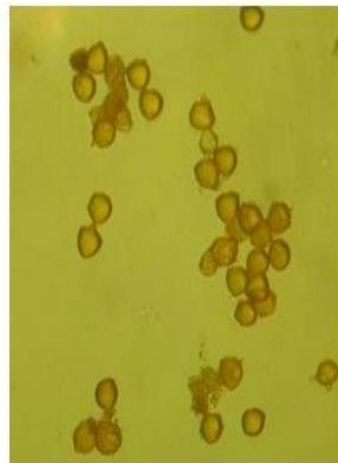
b) Unstained pollen grains (Sterile)