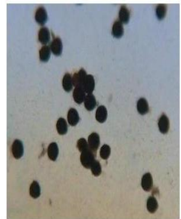
c) Darkly stained pollen grains (Fertile)