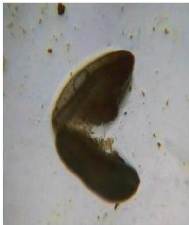
a) Anther without pollen grains (Sterile)