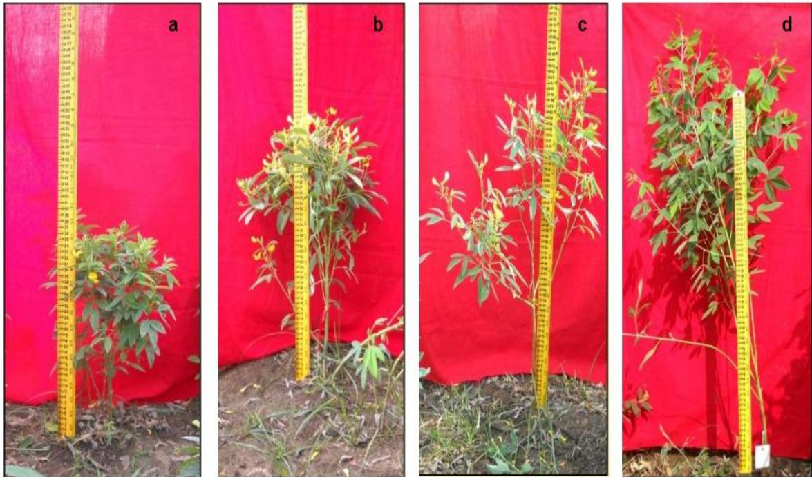
Fig. 1: Different height variants (a) Dwarf 30 cm (b) Dwarf 45 cm (c) Dwarf 60 cm (d) Dwarf 90 cm