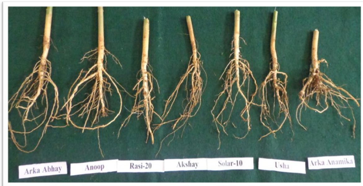
Fig.1 Number of galls produced by different cultivars of okra infested by M. incognita