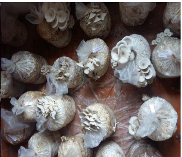
Plate 7 Spawn running of Intraspecific Hybrids, Plate 8: Pin Head formation of Intraspecific Hybrids, Plate 9 & Plate 10: Fruit body production of Intraspecific Hybrids