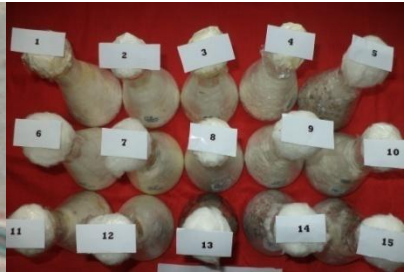
Fig 1 & Fig 2: isolation of single spore through spore print, Fig 3: Somatic hybridization in Pleurotus , Fig 4: Isolation of dikaryotic mycellium from meeting point, Fig 5: Microscopy for presence of clamp connection to ascertain hybridization, Fig 6: Production of spawn in conical flask.