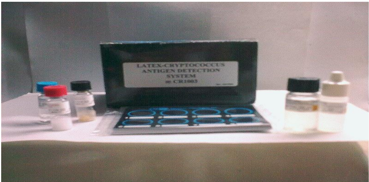
Fig.1 Latex-Cryptococcus Antigen Detection Kit

In the HIV-negative control group, there were no fungal isolates and all were negative for IIP. Antigen detection test was performed in 12 clinically suspected cases of cryptococcal meningitis and all these cases were found to be negative.