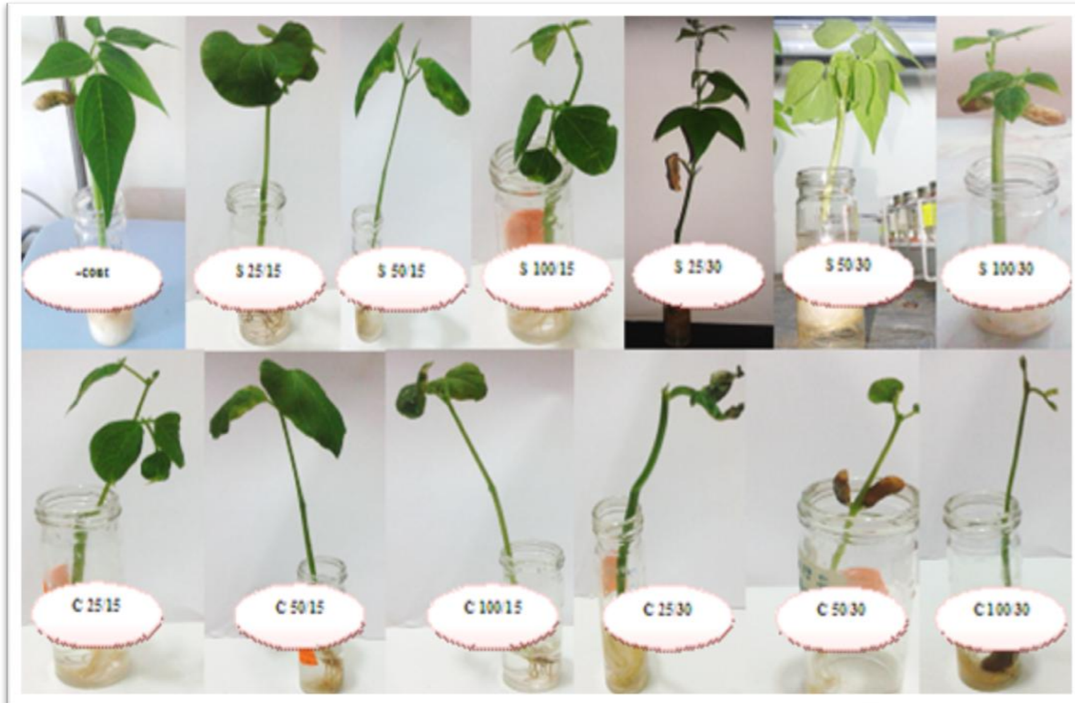
Fig.1 Phaseolus vulgaris seedlings originated from seeds treated and non-treated with silver and copper nanoparticles after six weeks of culture under growth chamber conditions. n=30.