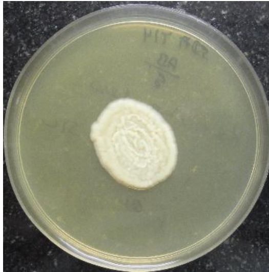
Fig.3 Rectangular arthroconidia of T. mucooides in corn meal agar