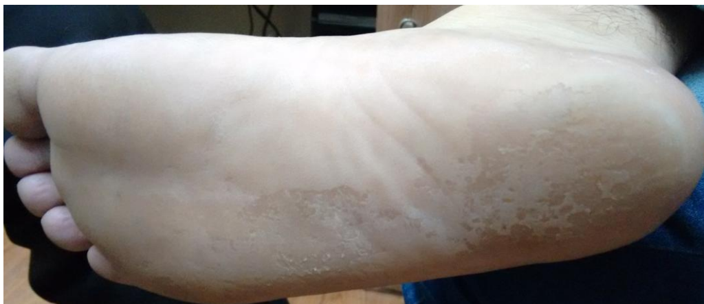
Fig.1 Diffuse depigmented scaling lesion on right foot (Sole)

The risk factors for infections T. mucoides include admission to an intensive care unit, antibiotic therapy, and the presence of a central venous catheter (Silva et al. , 2004).