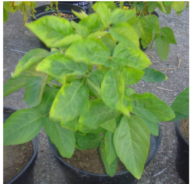
Virus CMV Virus