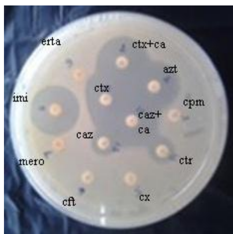
Ctx: cefotaxime, caz: ceftazidime, caz+ clavulanic acid, Ctx+ca: cefotaxime + clavulanic acid, azt: aztreonam, cpm: cefepime, ctr: ceftriaxone, Cx: cefoxitin, cft: cefotetan, mero: meropenem, Erta: ertapenem,