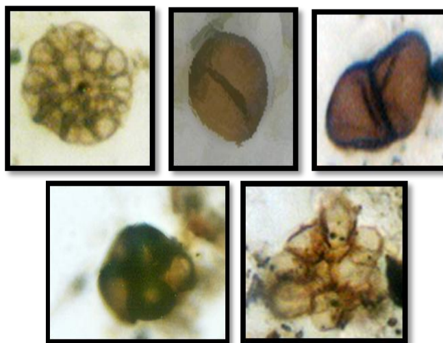
Fig.1 Fungal Spore

Sample of lower layer (40 ft) reveals several kinds of fungal spores that are different in size, shape, wall thickening etc (Fig 1). Pollen grain of grass origin is in high amount and some monosulcate apertural grains were identified those indicating palms ( Phoenix paludosa ) (Fig 3A). Fern spores like Lygodium , Ceratopteris were observed which are significant as they are not available now a days in our area of study. Typha pollen grains were sparsely present throughout the stratum indicating marshy habitat (Fig 3E). Chenopodiaceous grains were also recorded. At the topmost zone of this stratum Heritiera pollen grains were observed. Along with this some grains of palms, Excoecaria also recorded. At middle later (30 ft) also fungal spores with different morphology were recorded. Typical fern spores (triangular in shape with trilete aperture) noticed. Fern spores were recorded at lower part of this stratum, but absent in upper part (Fig 2).