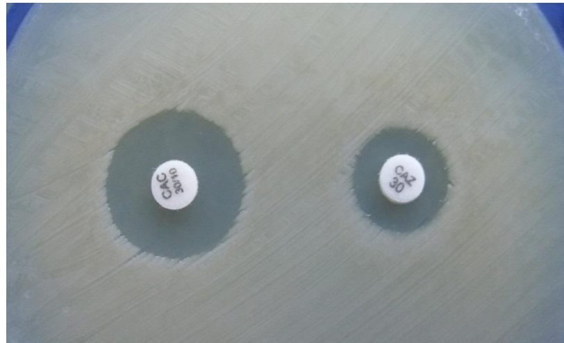
Fig.1 ESBL Detection by Phenotypic Disc Diffusion Method

OP:outpatient, IP: inpatient, ICU :intensive care unit, CTX: cefotaxime, CAZ: ceftazidime, CPZ: cefoperazone, CPM: ceftazidime, IM: imipenem, AC: amoxy-clavulanic acid, PTZ: piperacillin-tazobactam, AK: amikacin, CF: ciprofloxacin, COT: co-trimoxazole ( Numbers in parentheses represent percentage)