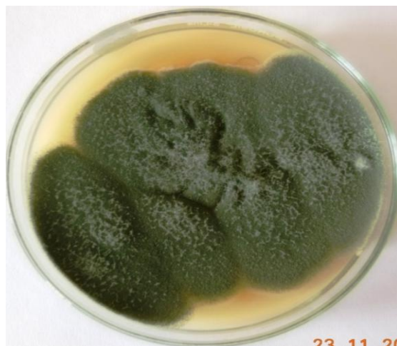
Fig.2 Reduction of Cod, Color and Cr(Vi) of Tannery Effluent After Treatment with Aspergillus flavus Spft2