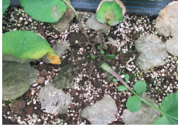
Fig.2 The symptoms of Cardamine violifolia at 7d post-inoculation.