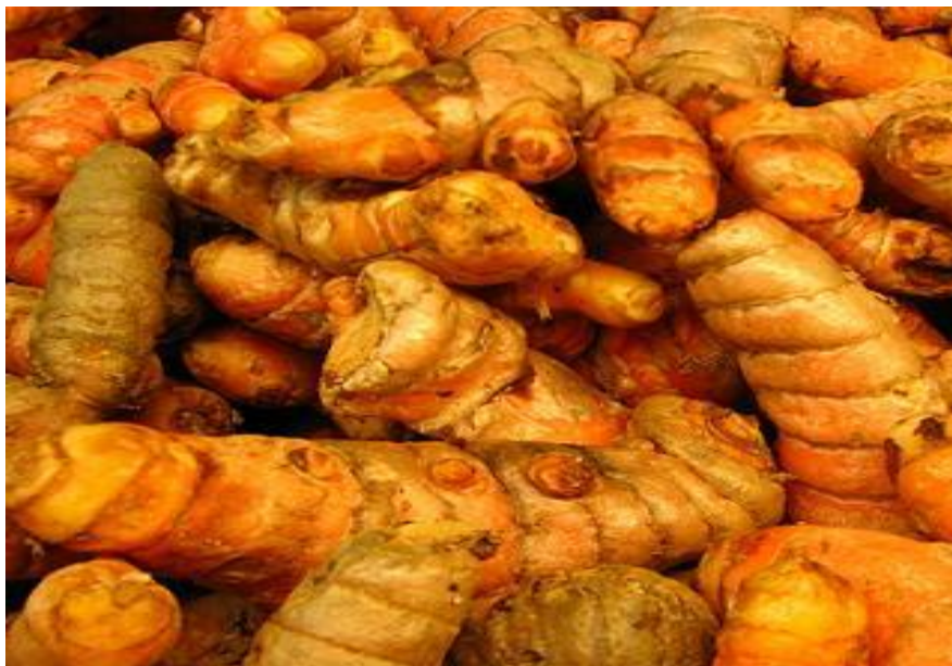
Photograph showing row rhizome of Turmeric ( Circuma longa )

The active constituents of turmeric are the flavonoids curcumin (diferuloylmethane) and various volatile oils, including tumerone, atlantone, and zingiberone. Other constituents include sugars, proteins, and resins. The best-researched active constituent is curcumin, which comprises 0.3–5.4 percent of raw turmeric. The major constituent, curcumin (diferuloylmethane) is in the most important fraction of C. longa and its chemical structure, was determined by Roughley and Whiting (1973). It melts at 176-177°C and forms red-brown salts with alkalis. Curcumin is soluble in ethanol, alkalis, ketone, acetic acid and chloroform; and is insoluble in water. In the molecule of curcumin, the main chain is aliphatic, unsaturated and the aryl group can be substituted or not. Curcumin is the principal curcuminoid of the popular Indian spice turmeric, which is a member of the ginger family (Zingiberaceae). The other two curcuminoids are desmethoxycurcumin and bis-desmethoxycurcumin. The curcuminoids are polyphenols and are responsible for the yellow color of turmeric. Curcumin can exist in at least two tautomeric forms, keto and enol. The enol form is more