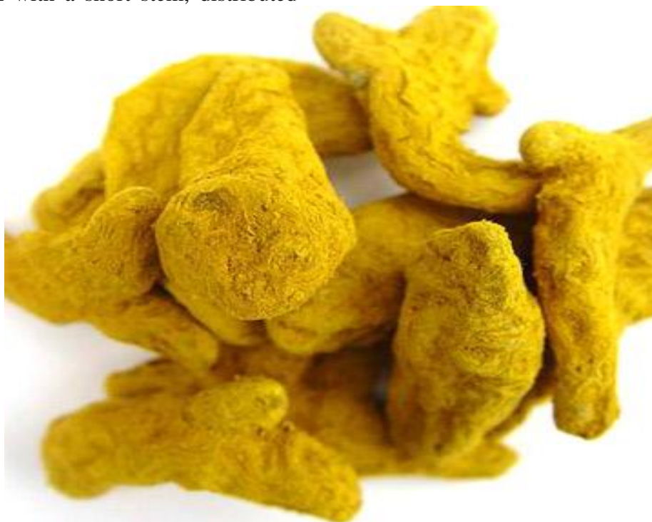
Photograph showing dried rhizome of Turmeric ( Curcuma longa )

throughout tropical and subtropical regions of the world, being widely cultivated in Asiatic countries, mainly in India and China. In India is popularly known as 'Haldi', in Malaysia, Indonesia and India has been well studied due to its economic importance. Its rhizomes are oblong, ovate, pyriform, often short-branched and they are a household remedy in Nepal (Eigner & Scholz, 1999). As a powder, called turmeric, it has been in continuous use for its flavoring, as a spice in both vegetarian and non-vegetarian food preparations and it also has digestive properties (Govindarajan, 1980). Current traditional Indian medicine claims the use of its powder against biliary disorders, anorexia, coryza, cough, diabetic wounds, hepatic disorder, rheumatism and sinusitis (Ammon et al. , 1992). The coloring principle of turmeric was isolated in the 19th century and was named curcumin, which was extracted from the rhizomes of C. longa , with yellow color and is the major component of this plant, being responsible for the anti-inflammatory effects.