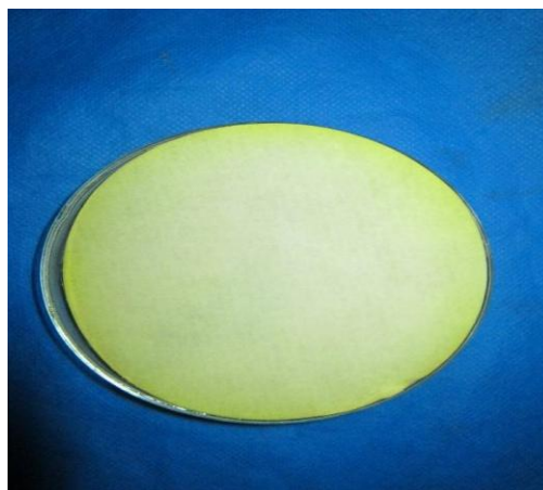
Fig.4 Change in color of peptone water in ammonia test