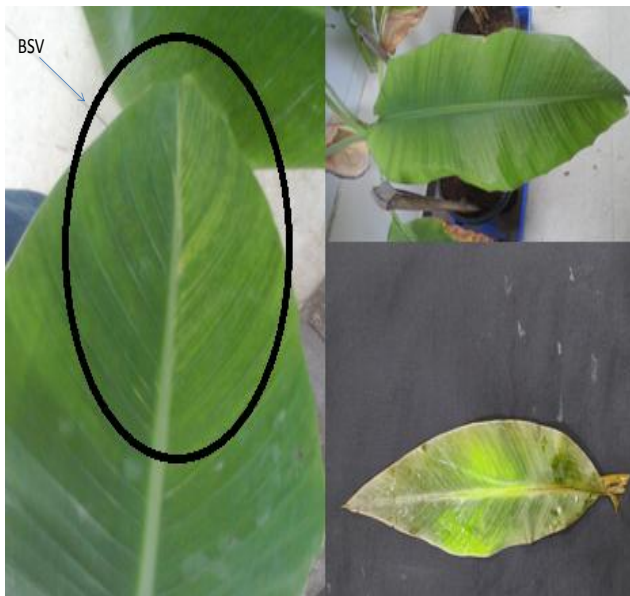
Fig.3 Sample from IARI, New Delhi