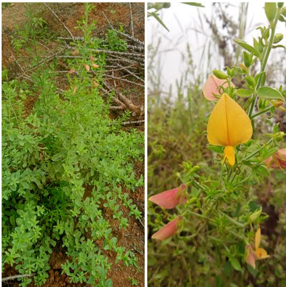
Fig.1 The plant used in the study, Crotalaria paniculata .