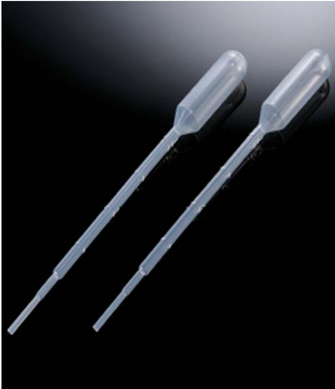
Fig.2 Sterile Pasteur Pipettes 3 ml quantity